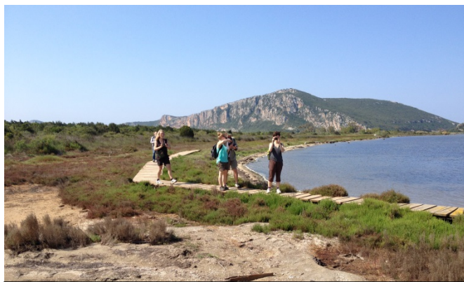
Figure 7. Nature trail, footbridge.