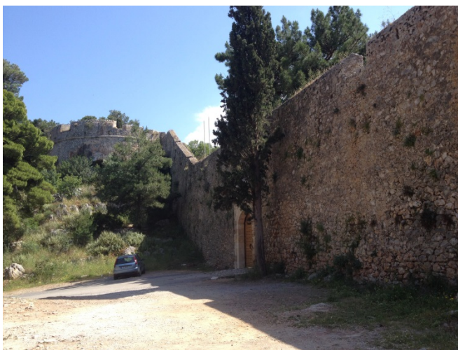
Figure 6. Niokastro, the outside wall.