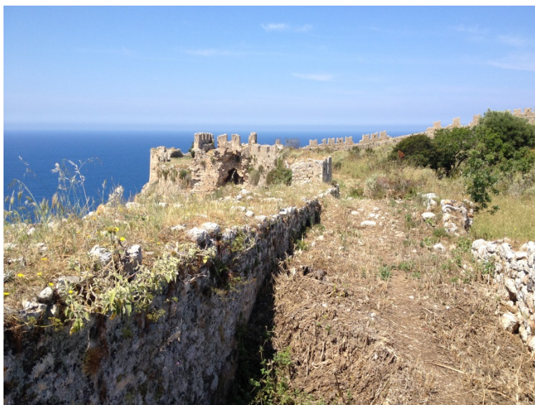
Figure 3. Paliokastro wall with a view over the Mediterranean Sea in the background.