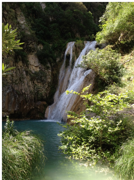
Figure 12. Polylimnio waterfall.