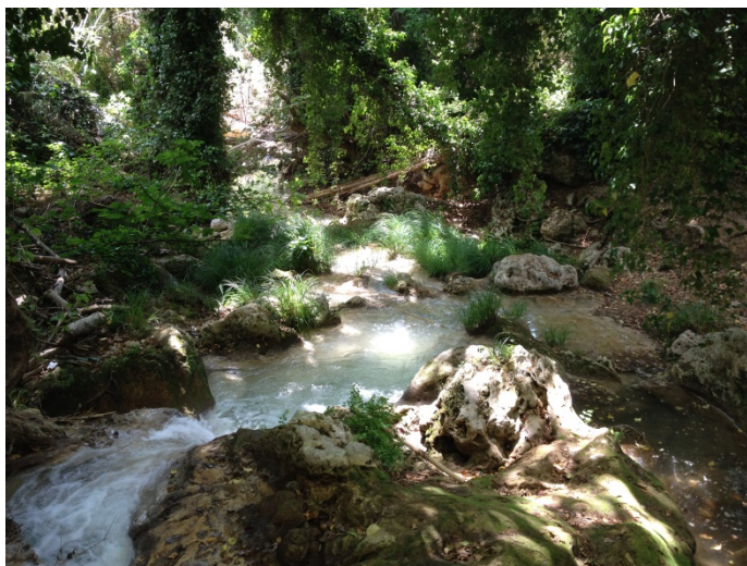
Figure 10. Kalamari waterfall, downstream the waterfall.

The Kalamari waterfall feels like a hidden secret place where you are probable to find yourself alone (Figure 10). There will be some more people during high season but it will never get very crowded (Giorgos Maneas, personal communication). This waterfall is the one closest to Gialova lagoon, just south of the village Schinolaka. The waterfall is reached by a footpath that takes some 10-15 minutes to walk. The path leads at first through very tall grass which decreases as you enter a more forest-like surrounding. After a while the vegetation will be almost a tunnel of ivy which gives a sensation of being in a jungle. When reaching the river, it has to be crossed in order to reach the waterfall and this could previously be done by a small bridge (Pylos.info 2014) but at the time of our visit, there was no bridge, there was simply a log to walk on. After that, there are some basic man-made stairs with a handrail. The waterfall (Figure 11) is just up the stairs.