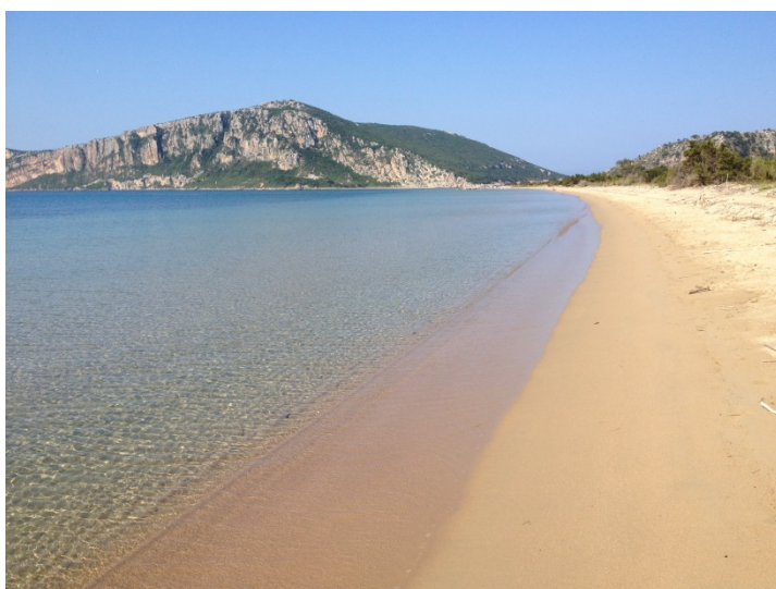
Figure 13. Divari beach.