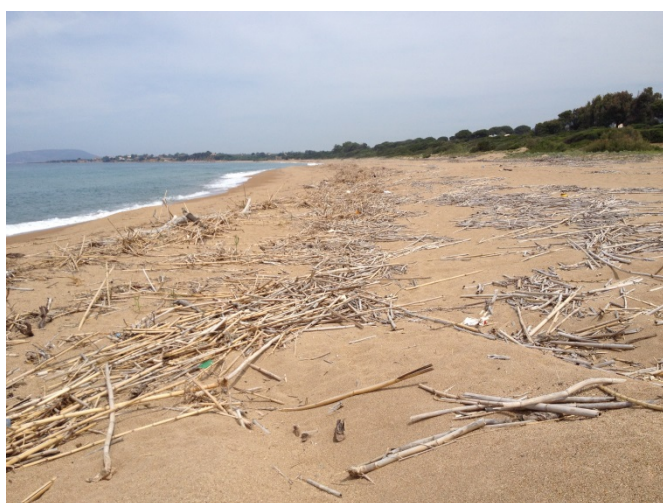
Figure 15. Romanos beach with washed up reeds.

Romanos beach is also a site of importance for the nesting of the loggerhead sea turtle