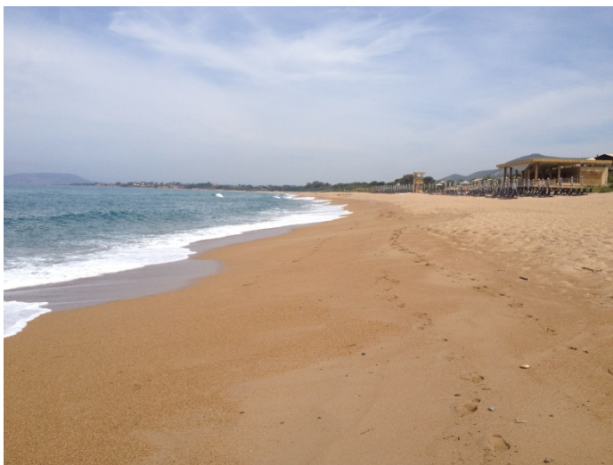
Figure 14. Romanos beach. The beach bar is visible to the right.

On the beach by the hotel there is a beach bar with accompanying sun chairs and umbrellas (Figure 14). There is also a life guard tower. There is a trashcan and sanitary facilities. The beach bar was not open at the time of our visit; supposedly it only opens in high season. Some bit from the beach bar, goals for ball sports have been put up. The beach had been cleaned from driftwood and washed up reeds (Figure 15) in the proximity of the beach bar.