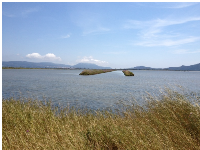
Figure 9. Gialova lagoon. View from the path around the lagoon.

The lagoon is accessible by car and there is a possibility to walk around the entire lagoon. The rich bird life at Gialova lagoon attracts some visitors and some tours are arranged by the Costa Navarino hotel but it is mostly individuals who go birding at the lagoon (Giorgos Maneas, personal communication).