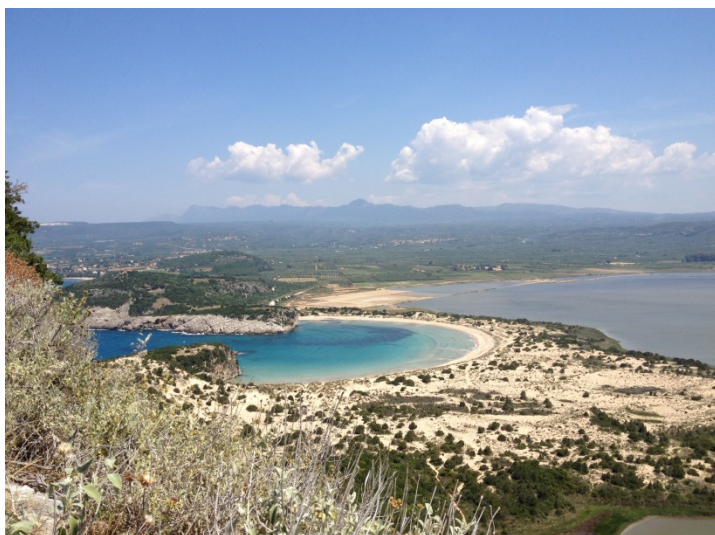
Figure 4. Voidokilia Bay as seen from Paliokastro.