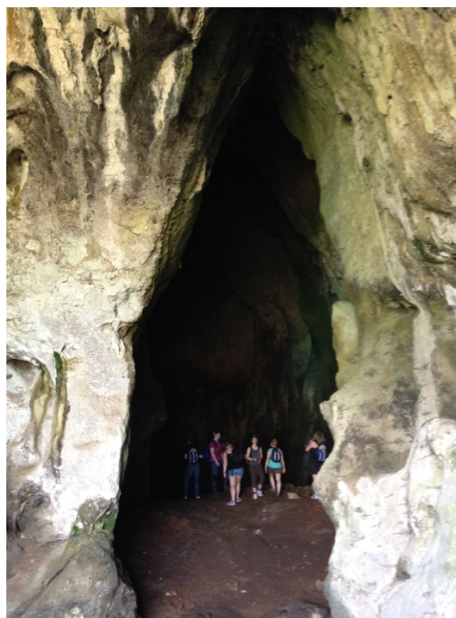
Figure 5. Nestor's cave