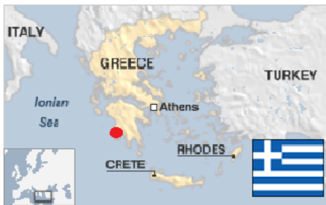
Figure 1 Map of Greece with the location of the investigation area marked in red.

The area investigated is located in the area around Navarino bay in Messinia in south-western Greece (Figure 1). It belongs to the Mediterranean temperate shrubland biome which is characterised by draught adapted short shrublands with a tendency towards grassy woodlands and the summers are hot with water deficits and the winter is cool with water surpluses (Christopherson 2012, pg. 596-598).