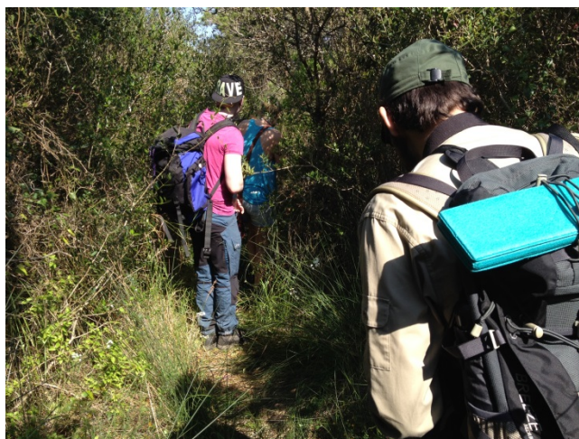
Figure 8. Nature trail, the overgrown path.

On the other hand, sensitive species such as the African chameleon ( Chamaeleo africanus ) live in the area and increased tourism could have a detrimental effect on these species in the form of disturbance, attrition, and habitat destruction and an increase in tourism would have to be managed carefully to avoid this. Of great importance would be to keep tourists from roaming the entire area by signaling they should stay on the trail at all times.