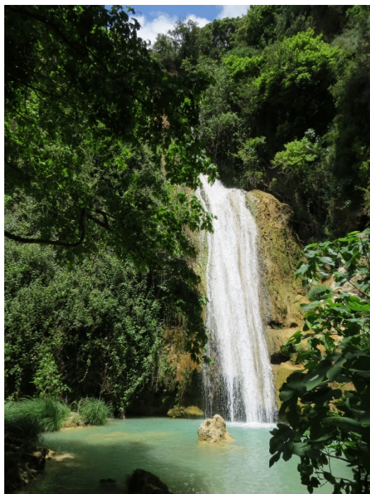
Figure 11. Kalamari waterfall.

This somewhat intricate process of reaching the waterfall requires good shoes and a physique good enough to both balance the log and climb the stairs, in which case for example a person in wheelchair would not be recommended to visit. As for the bridge, there is the possibility that it is only present during high season. It would certainly make the crossing of the river easier with a bridge.